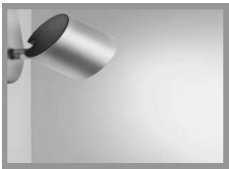
A "Luci" Light

Little lights — whether solar-powered or Jesus-powered — make a big impact in our dark world.