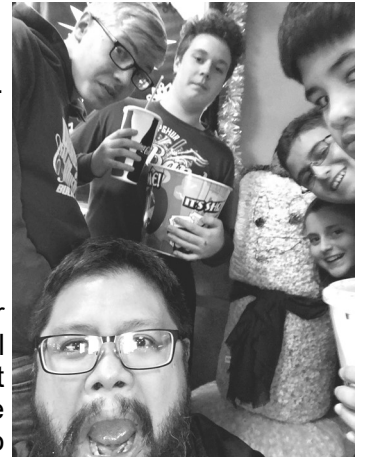
Enjoying a selfie with 'Popcorn Olaf' after Frozen 2 during free time!