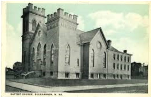
An early Post Card picture of the Buckhannon First Baptist Church. The view is from the corner of South Florida Street and Arnold Avenue. Date unknown.