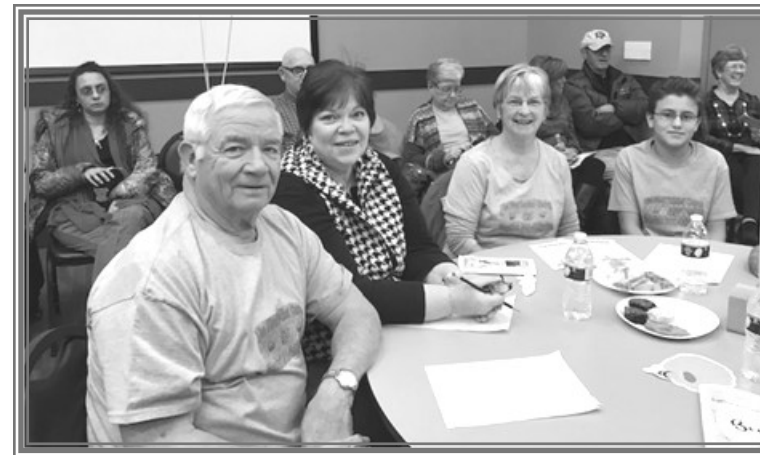
4th Annual Adult Spelling Bee, Friday, January 25. It is a fundraiser for the Upshur County Arts Alliance. There were 42 teams that participated. Our team was called the First Baptist Bee-Attitudes.

To read The Buckhannon Baptist newsletter online, news of upcoming events, and more, visit the Buckhannon First Baptist Church web-page at firstbaptistbuckhannon.net