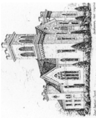
Dedicated in 1911

The First Baptist Church - 232 Years of Worship