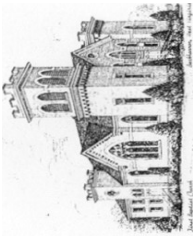
Dedicated in 1911