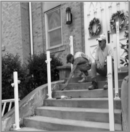
South Florida steps are repaired