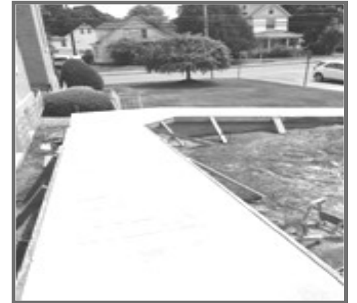
Concrete is poured for the walk