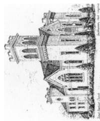
Dedicated in 1911