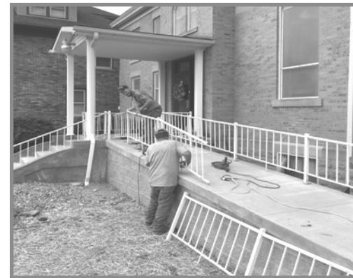
Replacing the rail