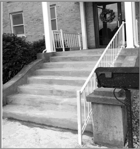
Hart Avenue steps have a new look

I read a story recently about the wife of a Federal court Judge. She was shopping at a clearance sale one day for a birthday present for her husband. She found the perfect necktie to match one of her husband's green sport coats.