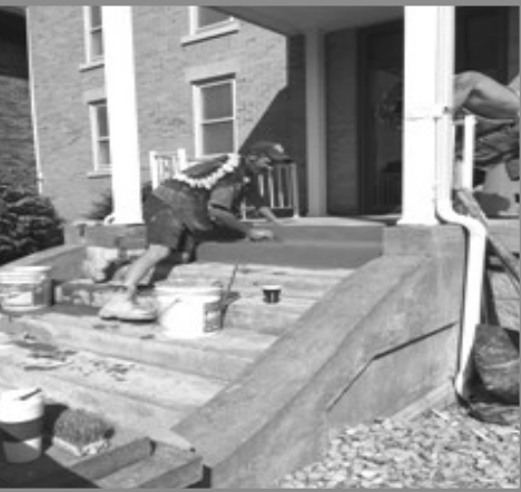
Hart Avenue steps