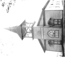
@ 1852 (Organized in 1786)