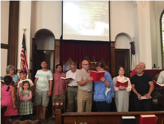
Volunteer Choir August 20, 2017