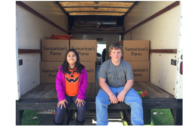
Our faithful kitchen crew!